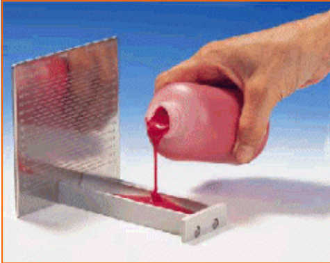
Elcometer 2290 Daniel Flow Gauge