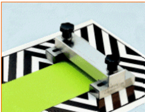
Elcometer 3545 Adjustable Bird Film Applicator

Elcometer also offer a wide range of Leneta Test Charts – the market standard – to meet all your specific requirements