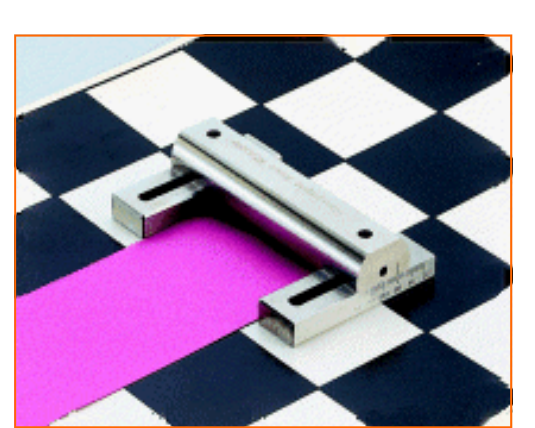
Elcometer 3525 & 3530 Adjustable Baker Film Applicator