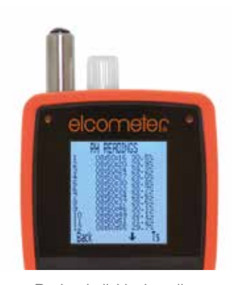
Review individual readings