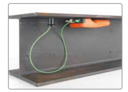
Remote monitoring of climatic parameters