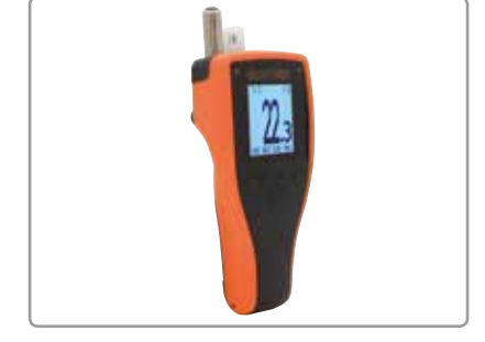
Waterproof and rugged to IP66