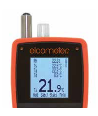
Large easy to read measurements in degrees °C or °F

This rugged gauge is designed to measure and record all relevant climatic parameters required to determine whether the conditions are suitable for painting.