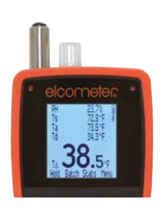
View up to 5 user selectable statistics on screen