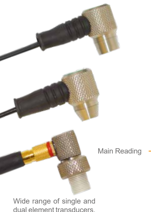
dual element transducers. (See page 19)