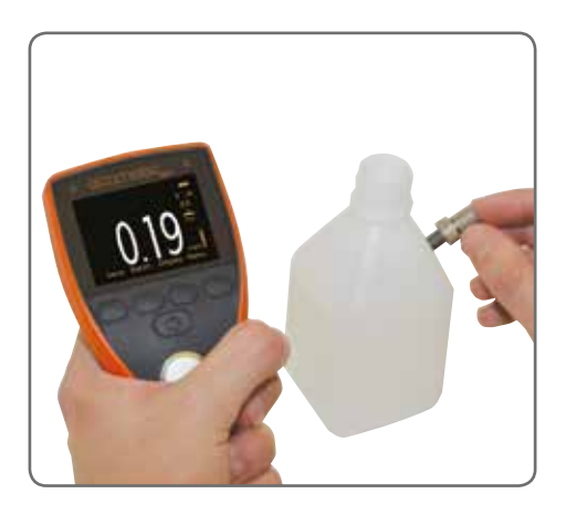
The PTG range of Ultrasonic thickness gauges is accurate to \pm 1\% from 0.15mm (0.006") to 25.40mm (1.000").