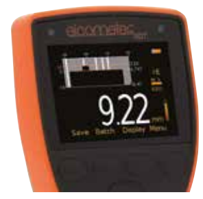
Cross sectional 2D B-Scan, ideal for relative depth analysis.