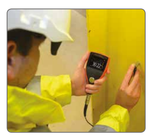
The gauges have all the features and functionality necessary to measure material thickness and velocity on virtually any material in a wide range of applications.