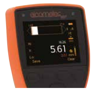
In scan mode the gauge takes readings at a rate of 16 Hz (16 readings per second).