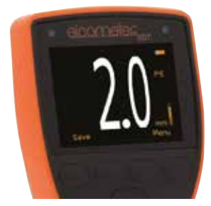
Large easy to read measurements in Metric or Imperial units.