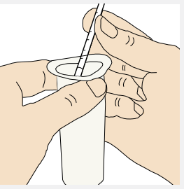
Remove cap from 2. Firmly apply test sleeve 3. Insert the titration tube