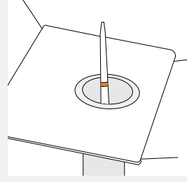
wait 1½ minutes.