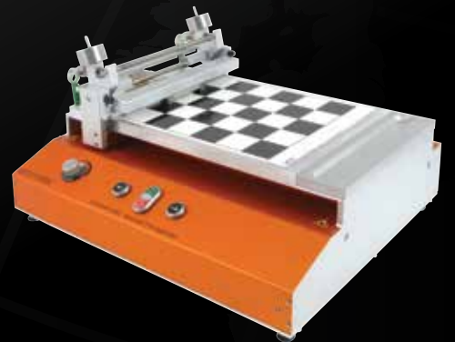
Elcometer 4340 Motorised/Automatic Film Applicator