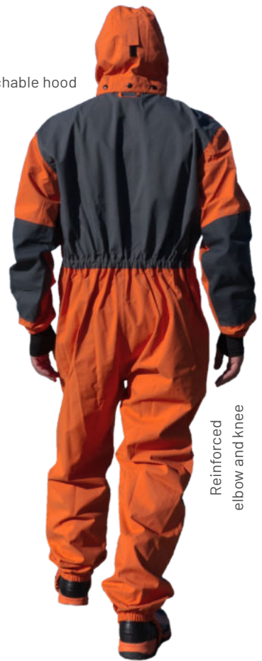
Reinforced elbow and knee